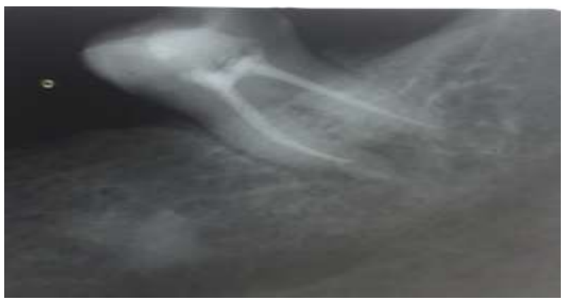
Figure 4: IOPAR of 38 after obturation