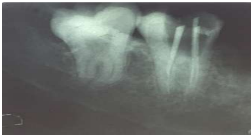
Figure 7: IOPAR of 47 with master cone along with fractured file