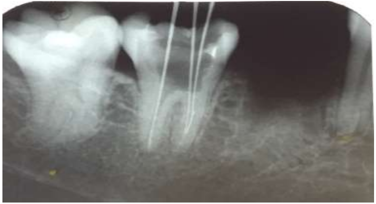
Figure 6: fractured file bypassed