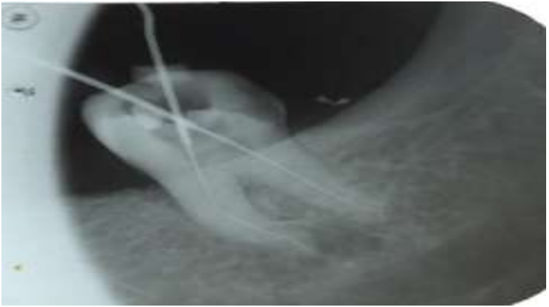
Figure 2: fractured file bypassed and working length determined