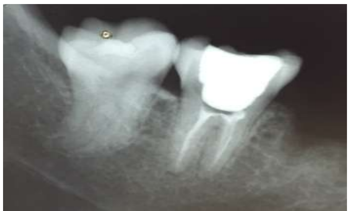
Figure 8: post obturation IOPAR of 47