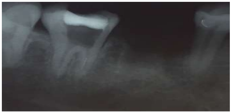
Figure 5: a fractured file in the mesial canal of 47